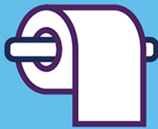
Change in bowel habits