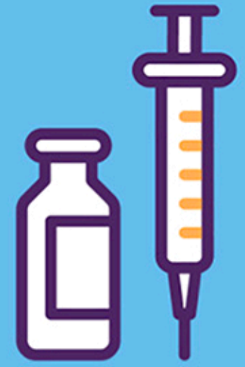
New onset diabetes