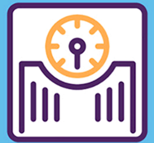
Unexplained weight loss