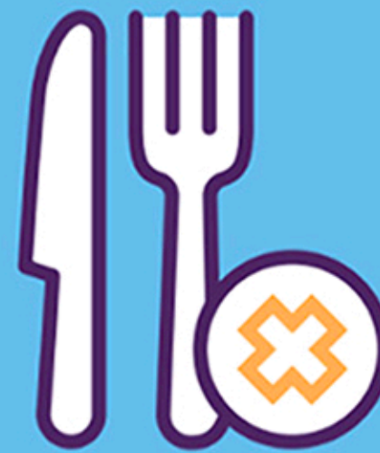
Loss of appetite